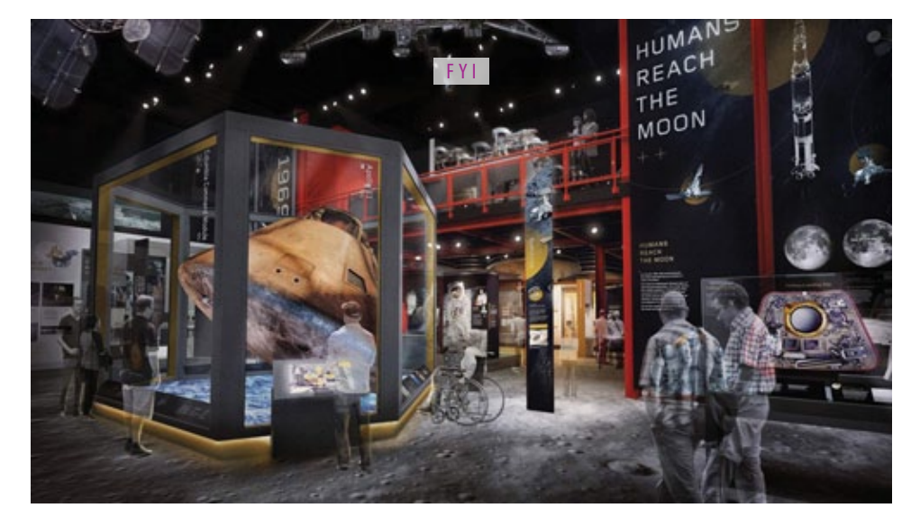
The new Destination Moon exhibition at the National Air and Space Museum in Washington, D.C.