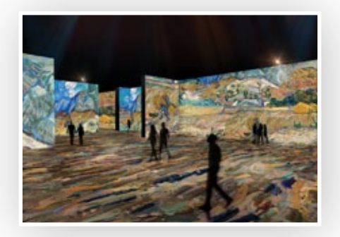
Rendering of THE LUME Indianapolis